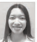
Mai Tram Foundation Scholarship