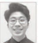
Alan Gan Cades Foundation Scholarship