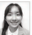
Kimberly Nguyen Shiro and Jean K. Matsuo Scholarship