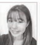
Rei Etsumi Foundation Scholarship