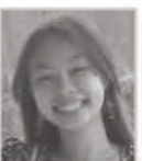
Rachel Li Foundation Scholarship in Memory of Lawrence Horakita