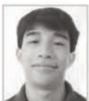
Steven Le Hung Wo & Elizabeth Lau Ching Foundation Scholarship