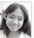
Aleiah Leilua-Toloi Foundation Scholarship