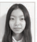
Julia Linn Ed & Itsuko Takamura Scholarships