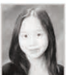
Lisa Diep McKinley Class of 1994 Scholarship