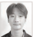
Joseph Kim Cades Foundation Scholarship