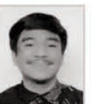
Alvin Agustín Henry & Gloria Onishi Scholarship